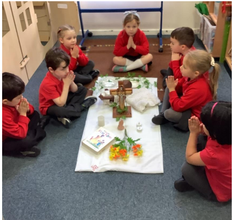
We regularly have the opportunity to say who and what we would like to pray for in small groups.