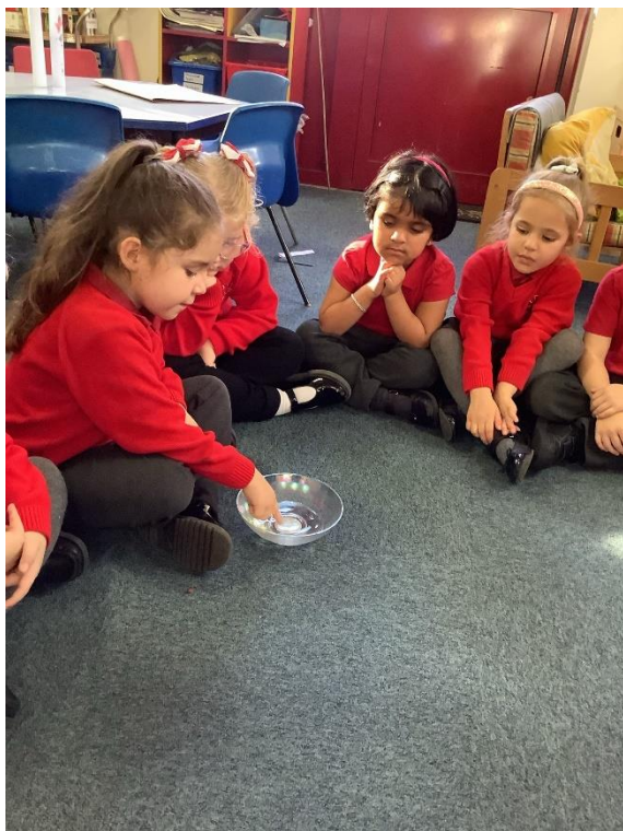
We sometimes gather together by putting our finger into a bowl of water and making the Sign of the Cross quietly.