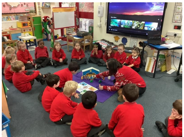
We also take part in KETT sessions where we use resources to help retell religious stories. Here we are talking about the Nativity story.