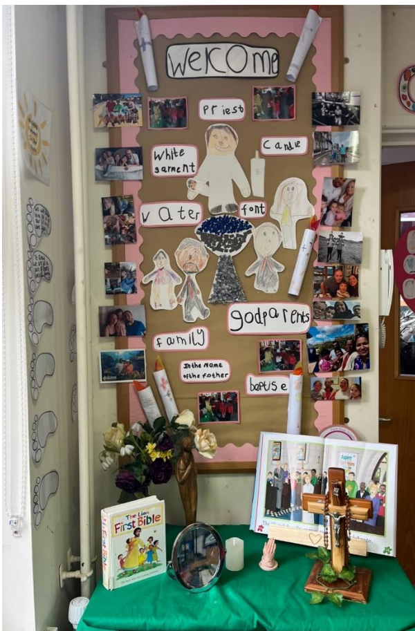
We have opportunities, as a class, to say what we would like to put on our prayer table and RE board.